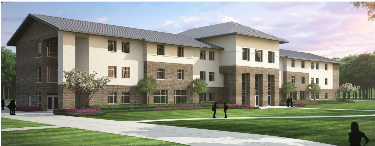
This conceptual rendering provided by LPK Architects, P.A., depicts what the new residence hall to be built on EMCC's Scooba campus will look like.