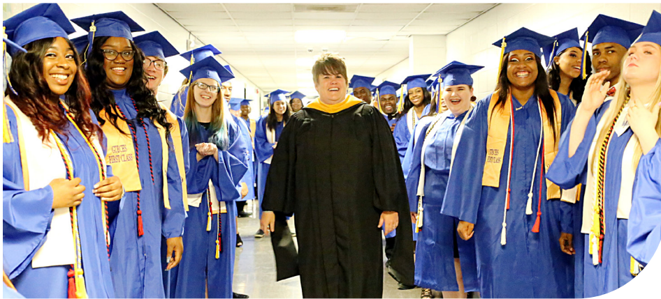
The Golden Triangle Early College High School's first graduation ceremony took place May 11 on EMCC's Golden Triangle campus.

The Golden Triangle Early College High School (GTECHS) on East Mississippi Community College's Golden Triangle campus celebrated many firsts in 2019. Those include the school's first junior/senior prom in March and the first graduation ceremony in May.